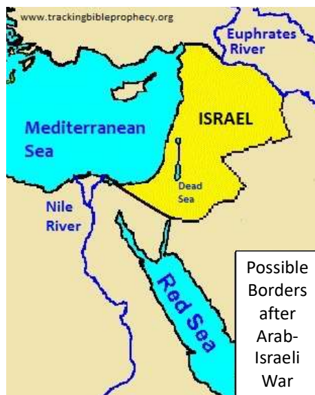
The "Greater Israel" that Results from the Arab-Israeli War